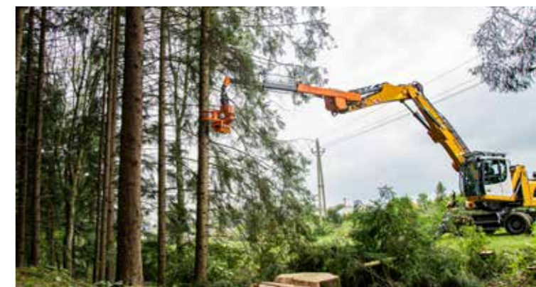
Telescope with two booms.

Technical data and illustrations are not binding. Subject to changes for reasons of further development.