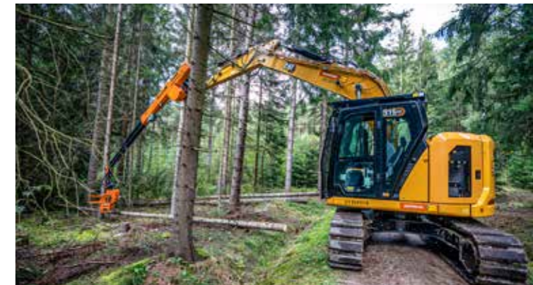
Hydraulic hoses on the inside.