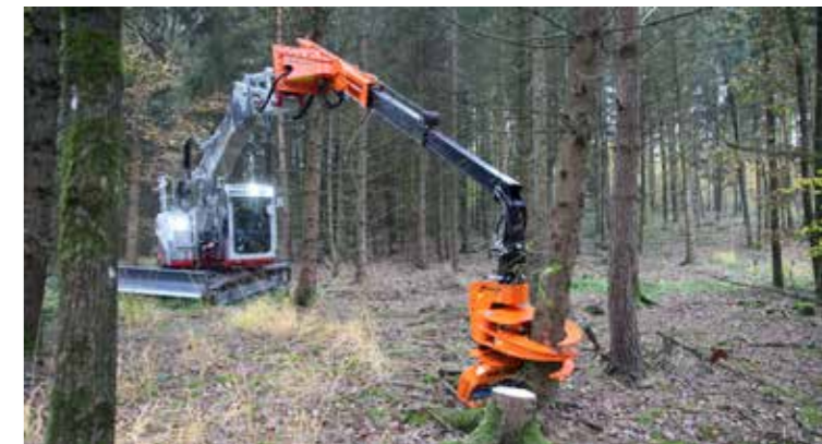
Work range extension up to 6,35 m.