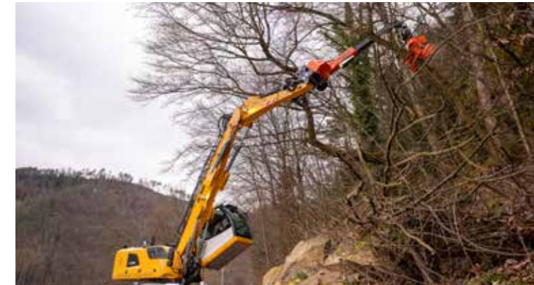
For all customary excavators.