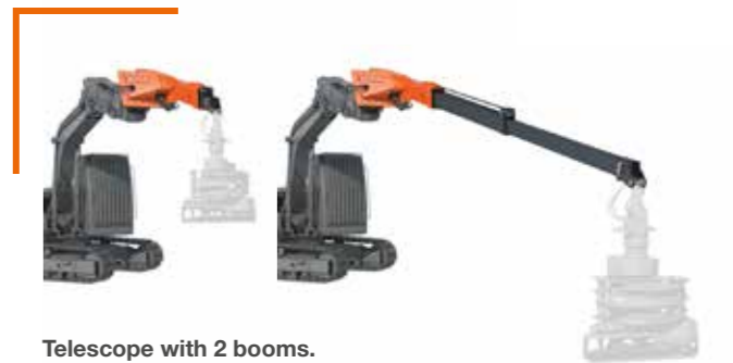
Telescope with 2 booms.

Caution: Woodcracker® T is not suitable for lifting work with hooks or other slings.